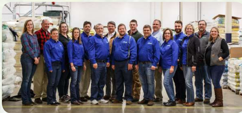
Southeast AgriSeeds is a sister company to King's AgriSeeds.